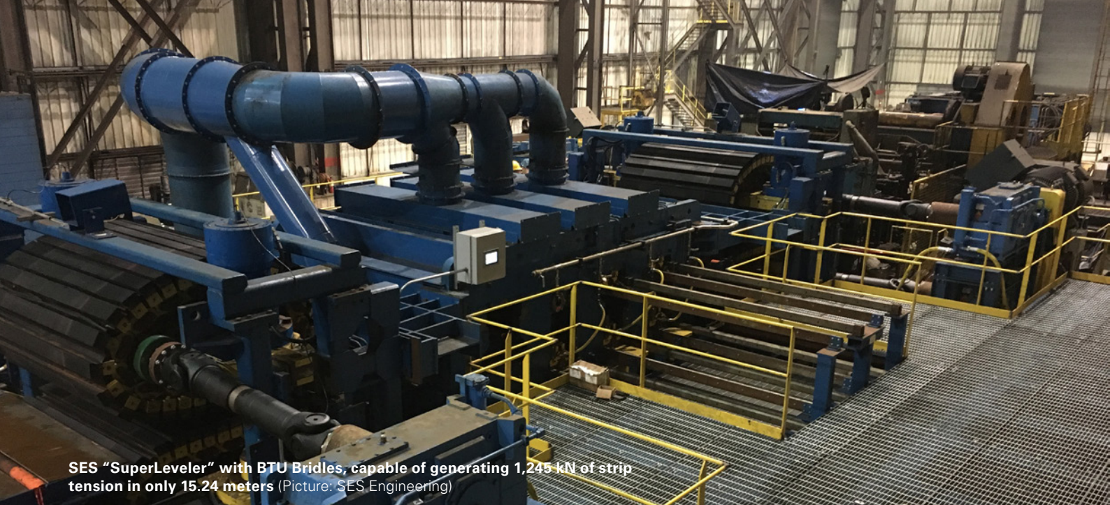
SES "SuperLeveler" with BTU Bridles, capable of generating 1,245 kN of strip tension in only 15.24 meters