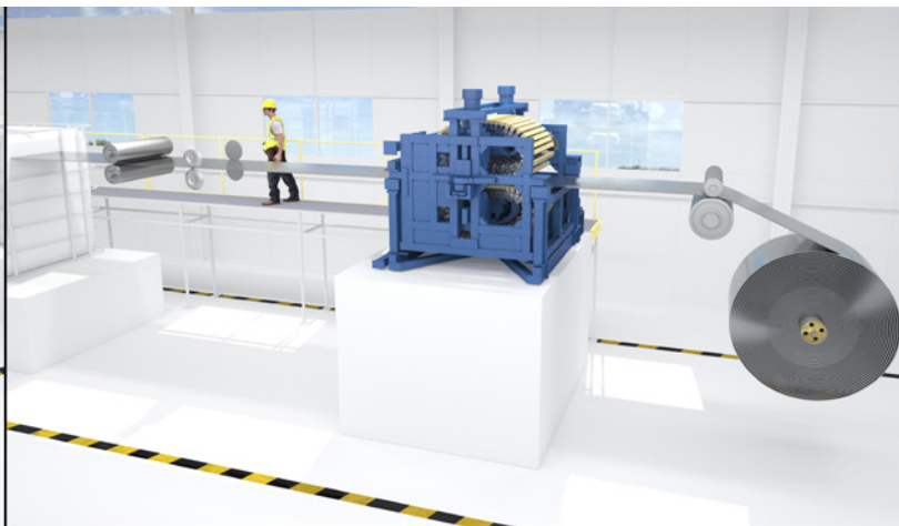
At the entry section (left) the two Umlauf Bridges produce strip tensions of up to 1,250 kN, whereas at the line run-out (right), the third Umlauf Bridge creates the back-tension needed to produce exactly wound coils

AHSS steels in gages between 1.5 mm (0,060”) and 12.7 mm (0,500”) with yield strengths between 1,700 and 7,500 N/mm 2 (25,000 to 110,000 PSI). Strip tension is now triple the value it used to be with the old