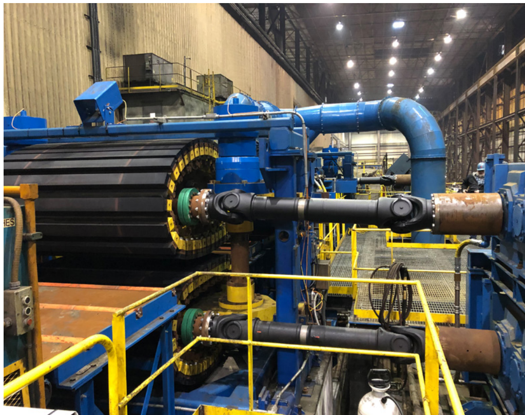
Entry section of the BTU Umlauf Bridle

As the Umlauf Bridles are arranged within the strip processing line, they build up the strip tension before the coiler bites the strip head. This significantly increases the usable coil length, in other words the yield. In certain strip processing lines this may lead to a plus of 20 meters per coil. Umlauf Bridles can be rotated very precisely through their vertical axis. This feature allows them to reduce strip camber during stretch leveling and correct the strip run so as to achieve highly precise trimming or recoiling.