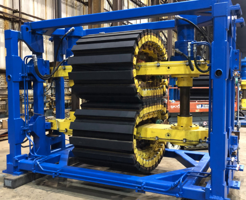
An Umlauf bridge shortly before installation

the recoiler, adjusting a back-tension that is optimal for the specific recoiling process. A special feature of the Umlauf Bridge is that it can rotate through its vertical axis. This ensures perfectly straight-edged recoiling.